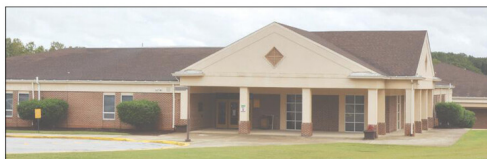
The first phase of repair work has been finished for Prince Edward Elementary. The next step begins within a few weeks.